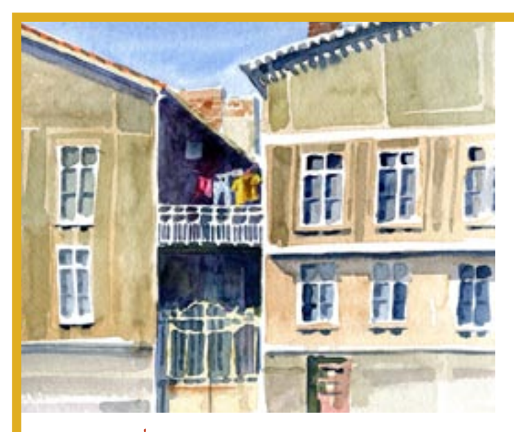
Varna, Bulgaría, a tired Soviet era resort city, squats at the shore of the Black Sea (which isn't black).