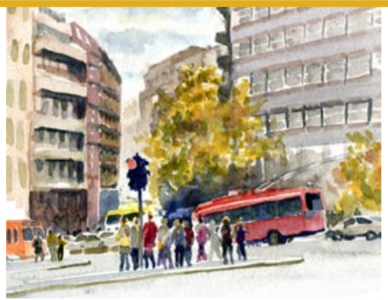
Belgrade, Serbía has colorful buses, but a legacy of ethnic tension and Soviet oppression stains their spirit.